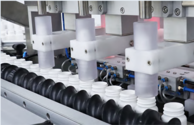
• Two-way insertion turret: 3 stations