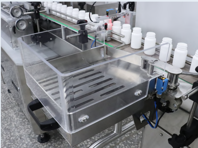
• Bottle Reject Station